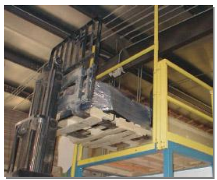
The forklift operator simply pushes the pallet through the gates and places it on the mezzanine.

The Self-Closing Pallet Gate in the closed position offers full-height edge of mezzanine protection with its 42" top-rail, mid-rail, and adjustable 4" toeboard.